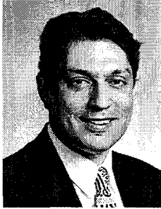
The Hon J Hatzistergos MLC Chairperson